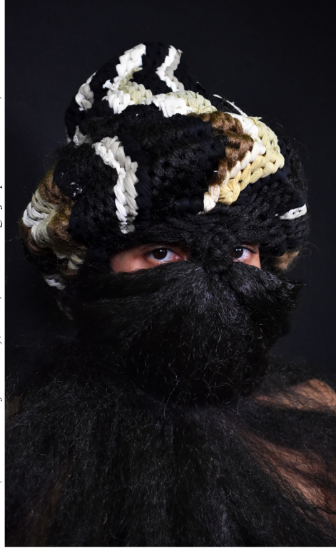
Molenza (Urine Trail of the Bull) , 2020, Archival lightjet print & Diasec, 50.8 x 33.8cm

With a look at history as circular and cyclical, the project uses a narrative tone in order to engage in an open dialogue with fragments of the archive. In so doing, the exhibition maps interconnected timelines of individual and collective memory.